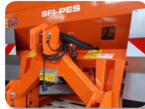
Integrated weighing system in the frame