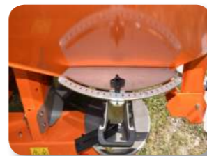
Regulation of the point of fall of the fertilizer