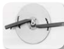
Disc & pallets 33-36 m