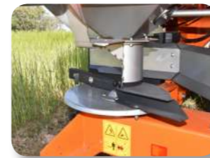
Palette 12-24 m