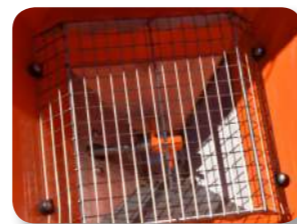
stainless steel screen