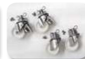
Storing support with wheels