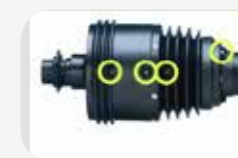
Cardan with Clutch