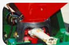
VICON pendulous distribution box