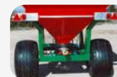
500/50-17 Flotation tyres