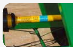
Mechanical transmission and PTO driven