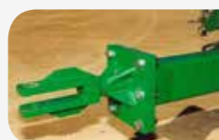
Screwed up and turning hitch