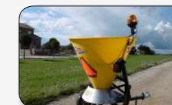
lights, rotary and shims