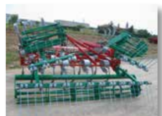
Hydraulically foldable from 3 m