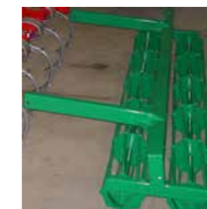
Rear twin roller