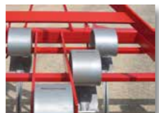
Tines screwed over solid steel bars