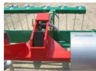
Roller adjustment system