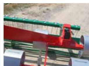
Kongskilde vibro tines