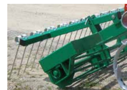
10mm springs harrow