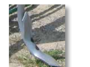
High quality steel two sided share