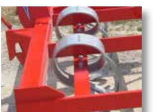
Reinforced frame with structural tube