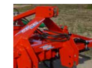
Third point linkage