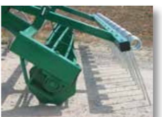
Ø400 roller with bearing