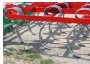
Three tine lines