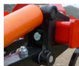
Tine hitch system to the frame