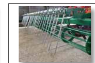
Comb made of 10mm springs