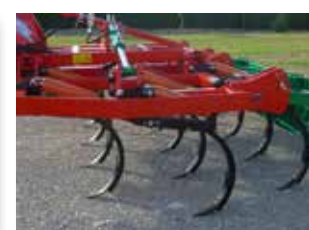
Three tines lines