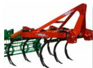
Two tines lines