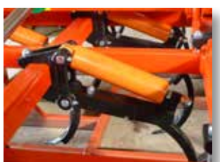
Tines pressure adjustment