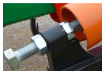
Springs pressure adjustment