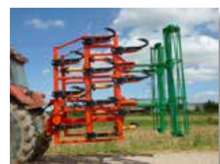
New vertical folding system