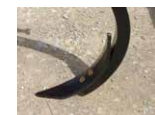
Two sided share made of boron steel