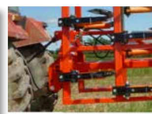
Third point hitch