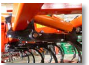
Reinforced frame with structural tubing