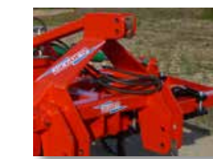
Third point hitch