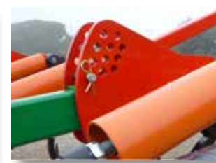
Roller adjustment system