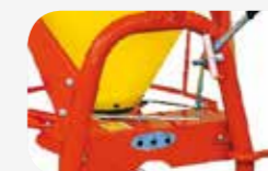
CAT I-II third point linkage