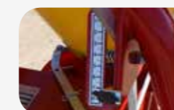
Hand adjusting system