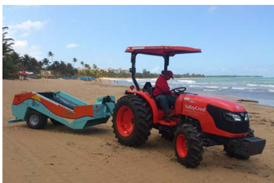
It is suitable for a 40HP mini tractor