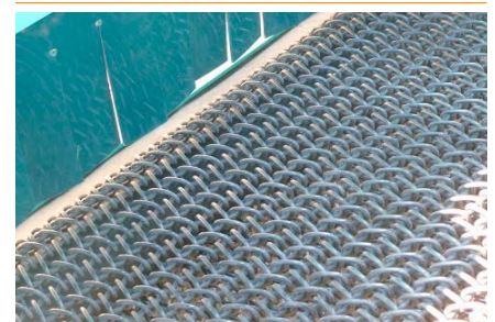
23mm mesh size