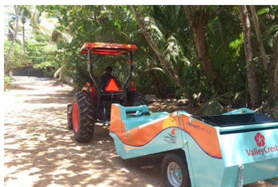
It makes the access to the beach or sandy area much easier