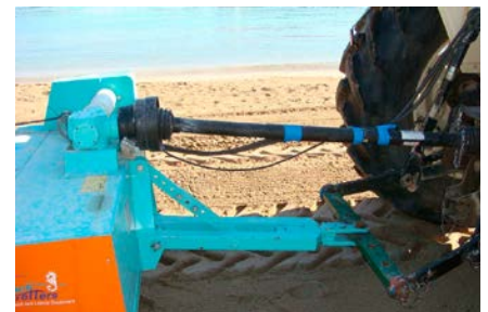
Mechanical drive of the power take off