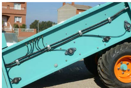
Centralized greasing system