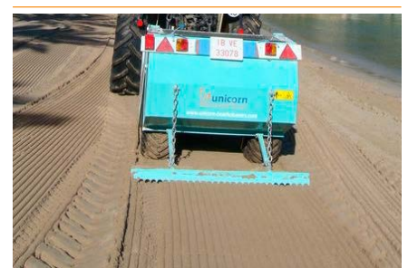
Smoothing of the sand