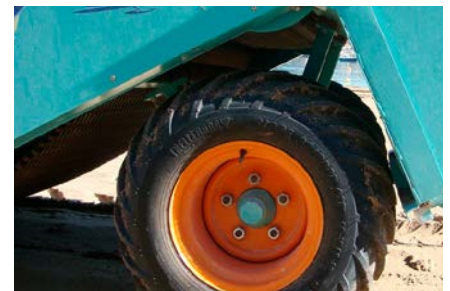
Wheels with great buoyancy on the sand