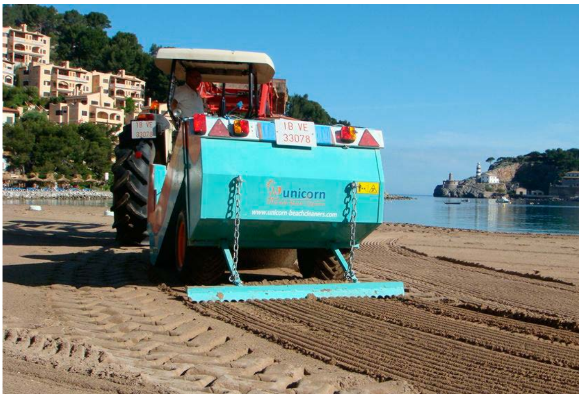
The UNICORN Resort KL guarantees an excellent finishing of the sand